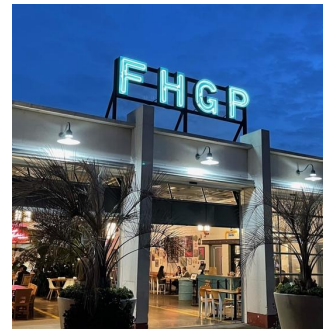
The FireHouse Venue

Located directly behind the Green Lawn, the Marfa emulates the desert environment of Marfa, Texas. Best use for events with pets, outdoor games, or as an add-on to the Green Lawn