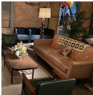
The Coffee Shoppe

Attached to the FireHouse Gastro Park, the Coffee Shoppe boasts a charming and retro atmosphere with antique elements. Best use for corporate meetings and intimate family gatherings.