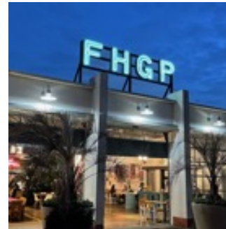
The FireHouse Venue

Located directly behind the Green Lawn, the Marfa emulates the desert environment of Marfa, Texas. Best use for events with pets, outdoor games, or as an add-on to the Green Lawn