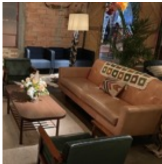
The Coffee Shoppe

Attached to the FireHouse Gastro Park, the Coffee Shoppe boasts a charming and retro atmosphere with antique elements. Best use for corporate meetings and intimate family gatherings.